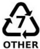
Figure 2: Logo, plastic resin code 7

More information on this topic can be found in consumer reports: